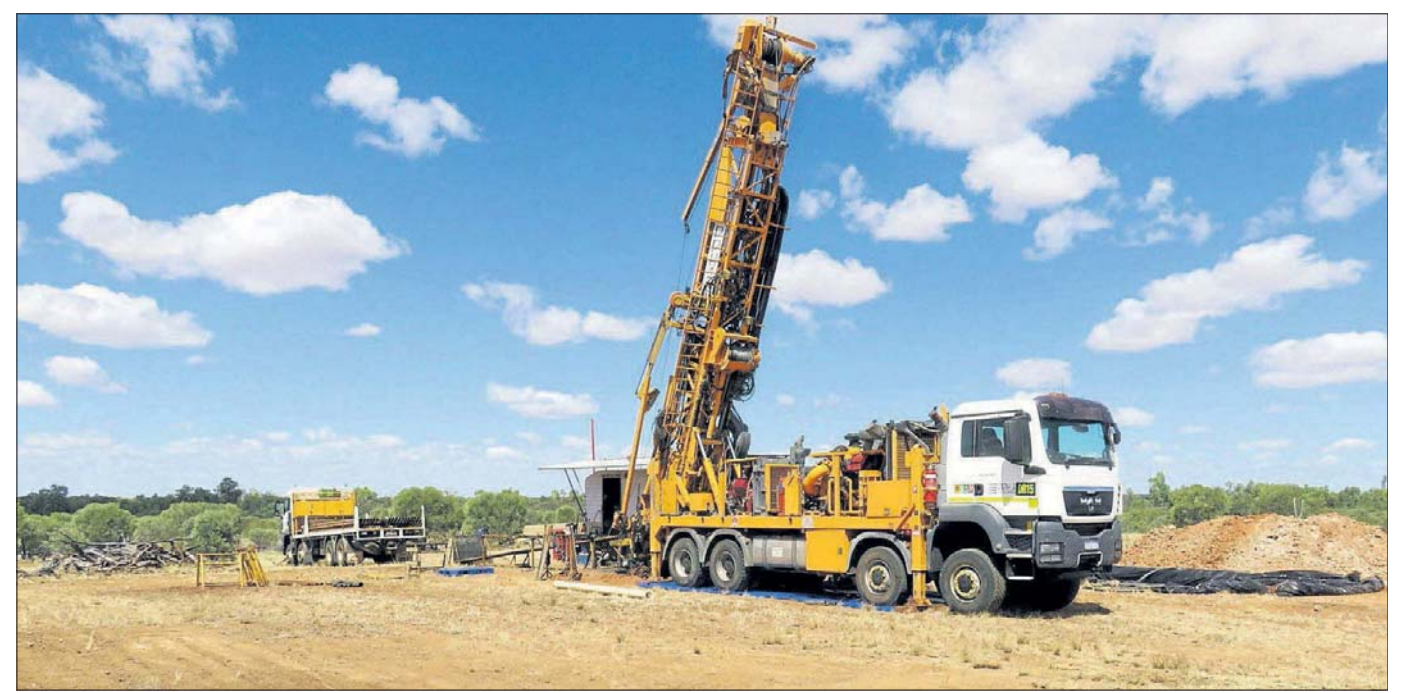
GOOD PROSPECT: Minotaur is drilling for copper-gold at Jericho 55km south-east of Cloncurry.